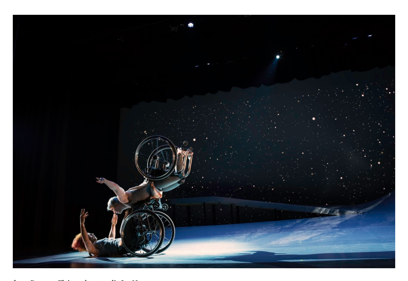
from Descent, Flying

I'm a political artist. And I don't mean social politics but rather with disability as a politicized thing. With my work the political statement isn't so much about the fight for equity but the assumption of equity and the expiration of culture and aesthetics and lineage and art history. And if you're still wrestling with your notion about what somebody in a wheelchair can or cannot do, I'm just like, "I can't, I can't, I can't." I have lived in that space for 12 or 15 years now and I don't want to be in that space anymore.